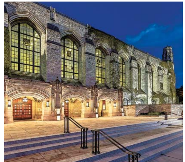
Charles Deering Memorial Library at Northwestern University