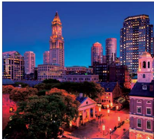
A View of Boston from the Square

That example has been very much on our minds as the Executive Council worked to complete the launch of the Association in a year marked by the COVID-19 pandemic, wildfires scorching the West, and storms battering the Southeast. Those tragedies affected us all, and made us especially thankful for the many friends and colleagues who pitched in to help us get the Association underway.