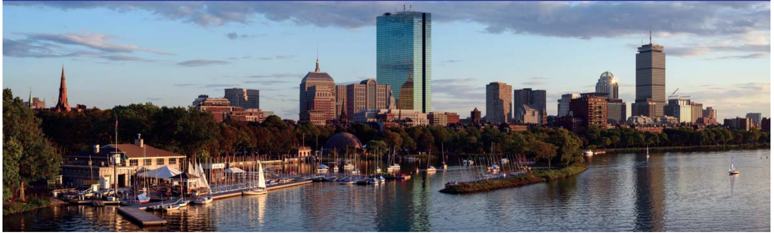
Boston, from the Harbor