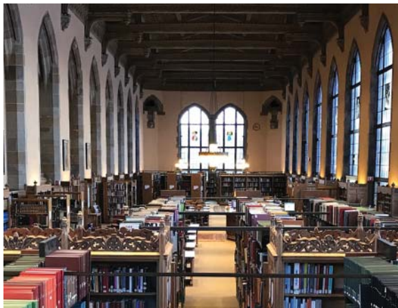
View from the stacks at Deering Memorial Library