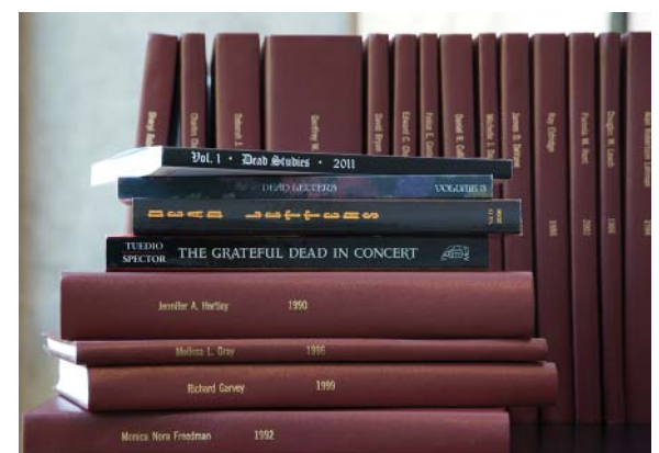
Bound theses and periodicals in the Dead Studies collection

The primary goal of the collection is to provide scholars and students with a complete history of Grateful Dead studies, but it also offers a wealth of insights for scholars researching a number of other fields, from the problems and potential of interdisciplinarity to the ways that discourse communities form and grow. With bound theses, periodicals, manuscripts and even artifacts, the collection comprises a range of formats and media that will also be able to support high-level, visually compelling exhibitions, both virtual and physical.